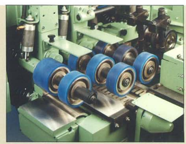
Outfeed Features: 220mm wide outfeed driven bed roller. 50mm staggered side heads. Hydraulically clamped outboard bearings.

Robust and reliable, the Wadkin GC300 has been designed as a cost effective planer moulder, for full 300mm (12") width capacity timber requirements.